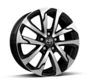
18-in. alloy wheel with black-painted machined finish<sup>4</sup>