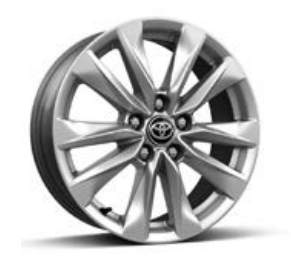
17-in. silver-colored alloy wheel